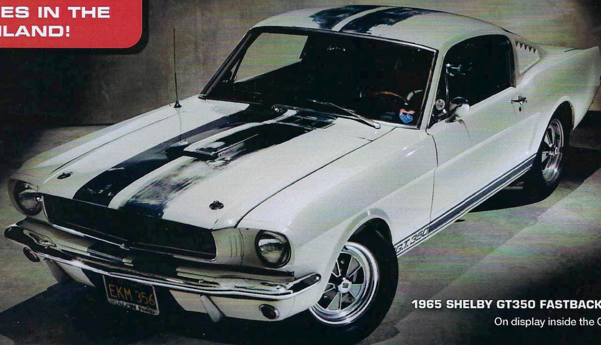
1965 SHELBY GT350 FASTBACK "BARN FIND"

LARGEST NUMBER OF CAR CLASSES IN THE SOUTHLAND!